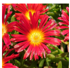
Hot Red Wonder