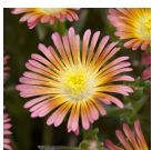
Salmony Pink Wonder